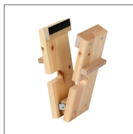
File clamp Art nr 33492