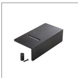
Universal anvil, adjustable Art nr 33617