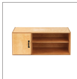
Sjöbergs SM07 Art nr 33273