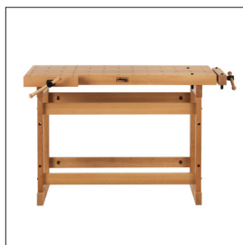
Sjöbergs Nordic Pro 1400 Art nr 33338