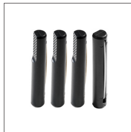
Bench dogs, round Art nr 33290