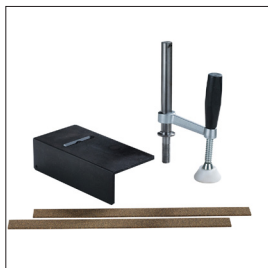
Accessory kit Sjöbergs Scandi Art nr 33301