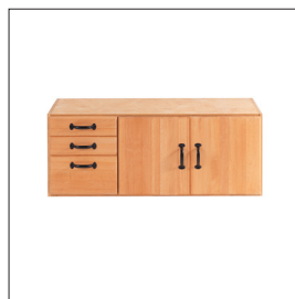
Sjöbergs SM03 Art nr 33457