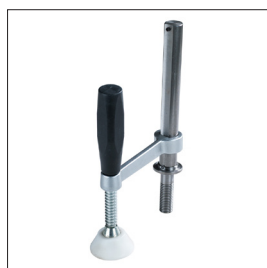
Holdfast ST11 Art nr 33639