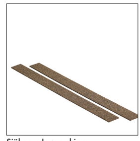
Sjöbergs Jaw cushions Art nr 33381