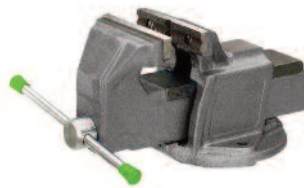
TABLE VISE WITH ANVIL