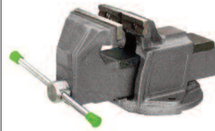
TABLE VISE WITH ANVIL