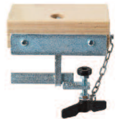
TABLE VISE HOLDER