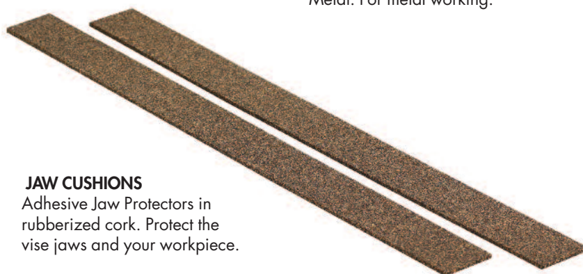
JAW CUSHIONS Adhesive Jaw Protectors in rubberized cork. Protect the vise jaws and your workpiece.