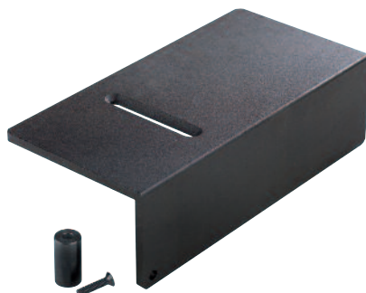
UNIVERSAL ANVIL Metal. For metal working.

Package size Accessory kit 320x230x110 mm