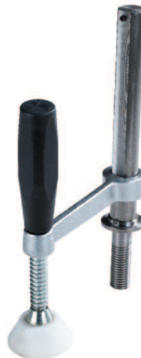
ST11 HOLDFAST Clamps around 360°.